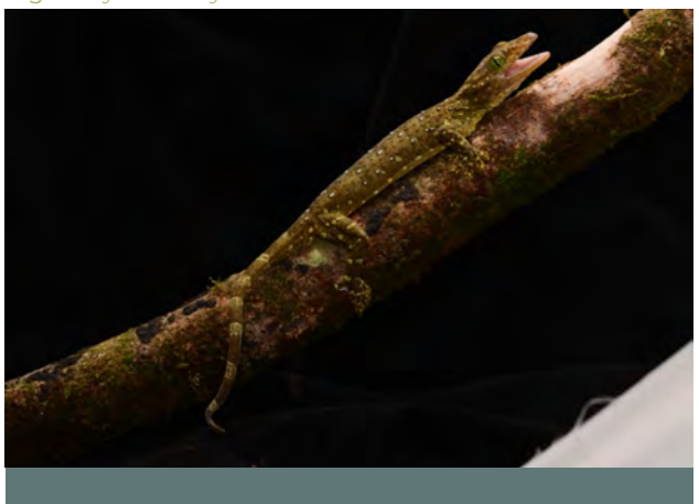
Fig. 10. Gekko cf. albofasciatus