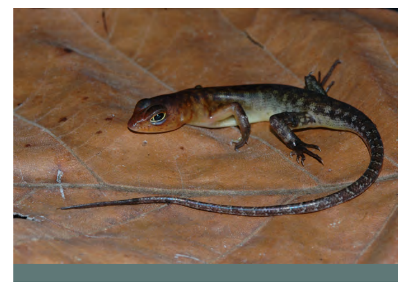
Fig. 17. Sphenomorphus multisquamatus

On dry, hot days, Kubah National Park (and the adjacent Matang Wildlife Centre) are great sites for observing Flying Lizards (Draco), and as many as six species have been recorded here. They are most often seen on trunks of trees with smooth bark, and apart for one or two, most are members of the forest interiors, some of the larger species, even of the higher branches, making identification a challenge. However, at least two of these species, the Common Flying Lizard (D. sumatranus) and Obscure Flying Lizard (D. obscurus) are found in edge-habitats, and more commonly encountered on the walk along the Summit Trail, and are also abundant in the Park Headquarters area of Kubah. Visitors to the Wildlife Centre at Matang may wish to also visit the rehabilitation centre, where representative species of the more 'famous' wildlife of Borneo are housed, including Orangutans, hornbills, gibbons and the Tomistoma or False Gharial.