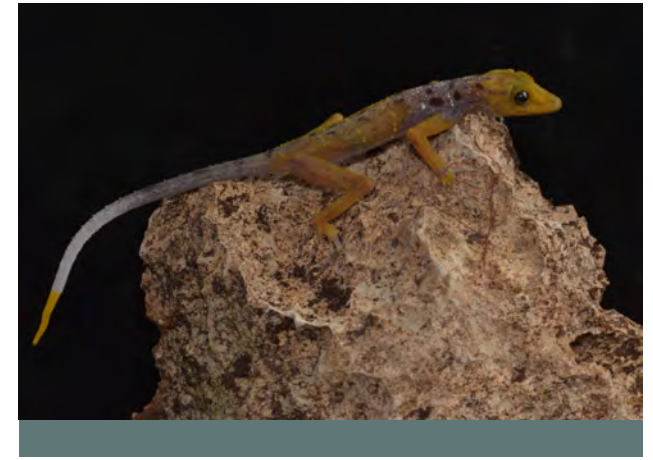
Fig. 6. Cnemaspis matahari