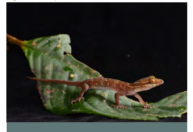
Fig. 8. Cyrtodactylus muluensis