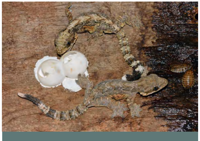
Fig. 12. Gekko kuhlii