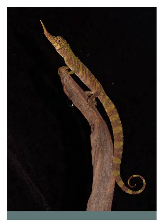
Fig. 3. Harpesaurus borneensis