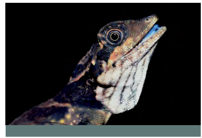
Fig. 2. Gonocephalus grandis

For those who can slip out of town in the evenings, we can recommend Kubah National Park, located about 45 minutes to the north of the city (and the source of our drinking water supply). Highlights of the Park are four species of Angle-headed Lizards ( Gonocephalus ), whose ecology was studied by one of us, Sandra (Wong Jye Wen).