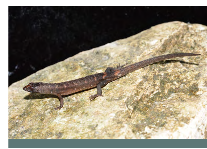
Fig. 19. Tropidophorus micropus