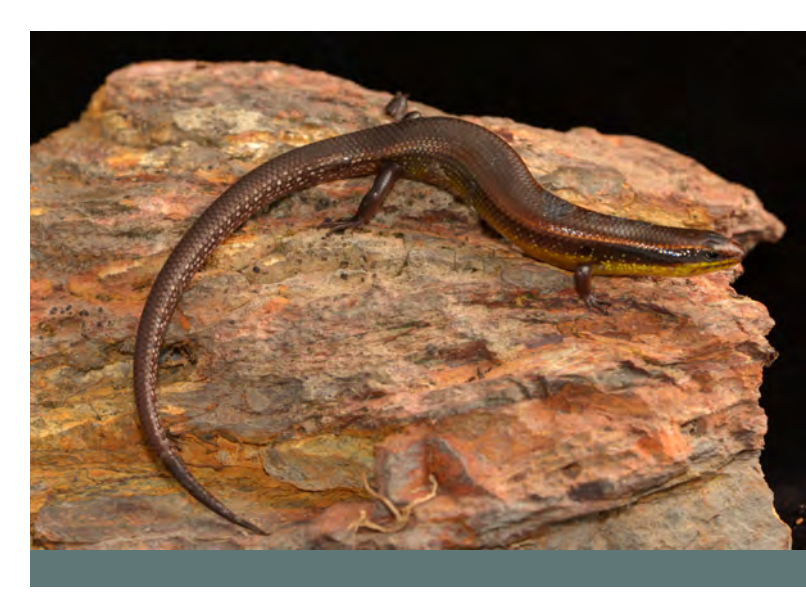
Fig. 18. Subdoluseps samajaya