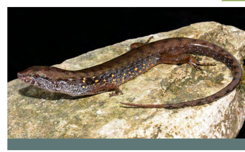
Fig. 20. Tropidophorus sebi

Other species we can highlight from areas close to Kuching include the Black-lipped Shrub Lizard ( Pelturagonia nigrilabris ) and the Penrissen Limbless Skink ( Larutia kecil ) from Gunung Penrissen, the Gading Day Gecko ( Cnemaspis nigridia ) and Cat Gecko ( Aeluroscalabotes felinus ) at Gunung Gading National Park and the Crested Flying Lizard ( Draco cristatellus ) at Gunung Santubong National Park.