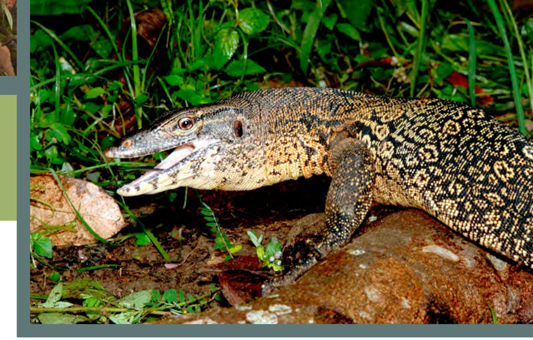
Fig. 24. Varanus salvator

Fig. 23. Sandra Wong Jye Wen radio-tracking and georeferencing a Gonocephalus doriae .