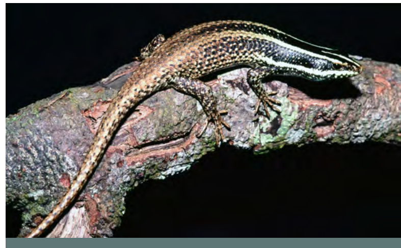
Fig. 15. Dasia vittata

from exposure to indirect solar radiation. With energy gained from the sun, they may even play rounds of 'hide-and-seek' with you around the tree trunk, attempting to evade your sight, while some lurk in the shadows of saplings on the forest floor ambushing a meal. These opportunists feed on a wide variety of prey, including insects, earthworms, and snails.