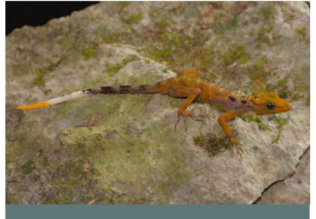
Fig. 7. Cnemaspis paripari