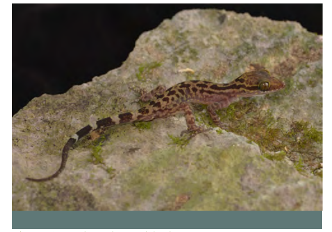
ig. 5. Cyrtodactylus pubisulcus