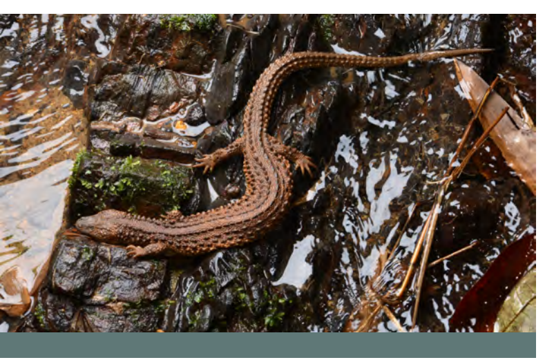
Fig. 14. Lanthanotus borneensis

Amongst the four species found here, the Bornean Angle-headed Lizard ( G. bornensis ) and Doria's Angle-headed Lizard ( G. doriae ) may be worth looking for, as they are endemic to Borneo. Species of this genus tend to restrict their movement within their respective home range that often overlap, and their homing ability is astonishing. Like many other agamids, they