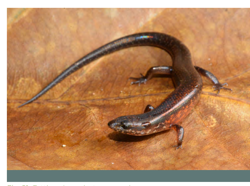
Fig. 21. Tytthoscincus batupanggah