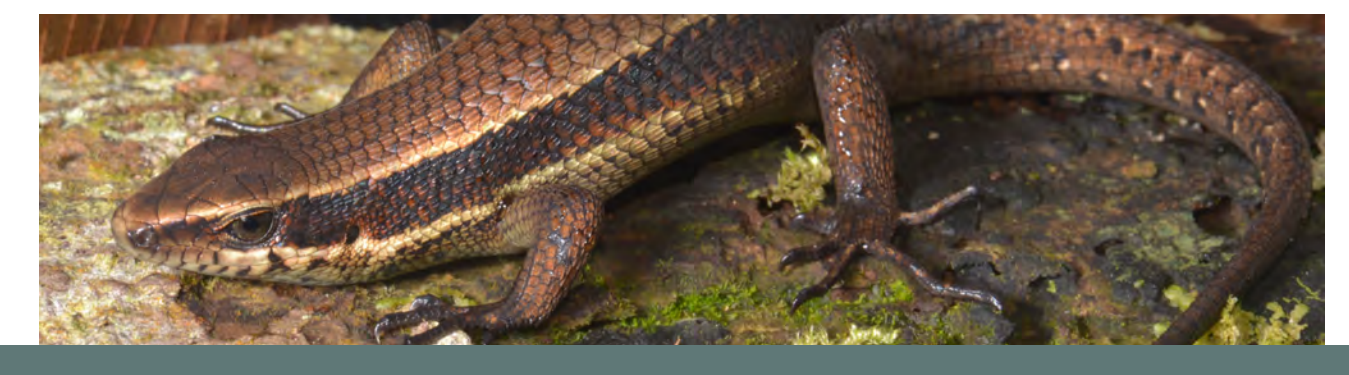
Fig. 16. Eutropis rudis