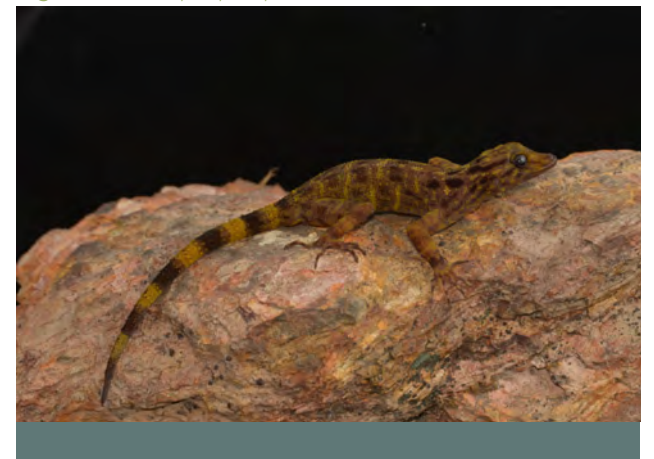
Fig. 9. Cnemaspis nigridia