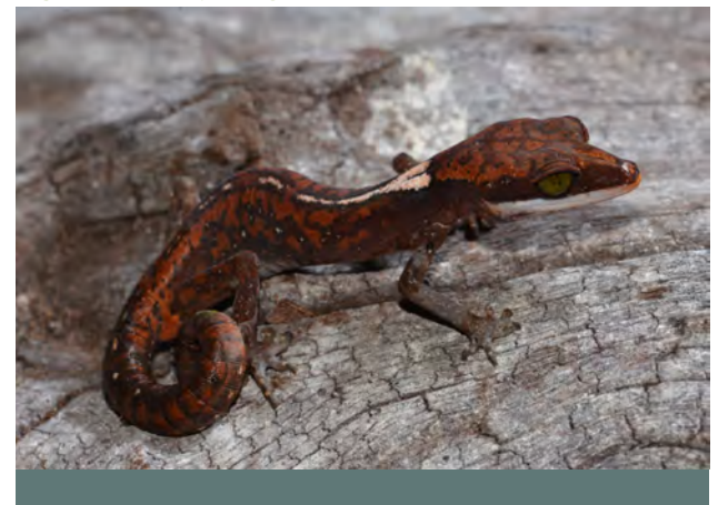
Fig. 11. Aeluroscalabotes felinus